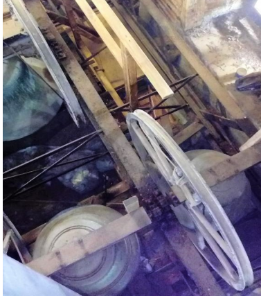
Beam of death through the bells

Seventy two people signed up for the Tower Tour, most of whom made it to the top; no shame to those who decided that the level of the bells was far enough. The steep ladders and walking across from one side of the